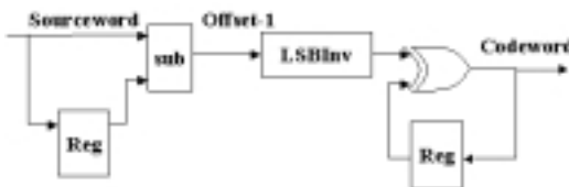
Figure 3- Offset-Xor-SM Encoder