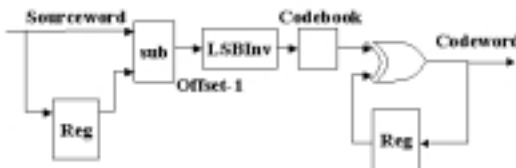
Figure 4- Offset-Xor-SMC Encoder